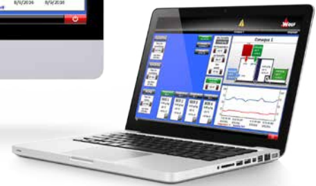
Honeycomb humidifier with cascade circuit