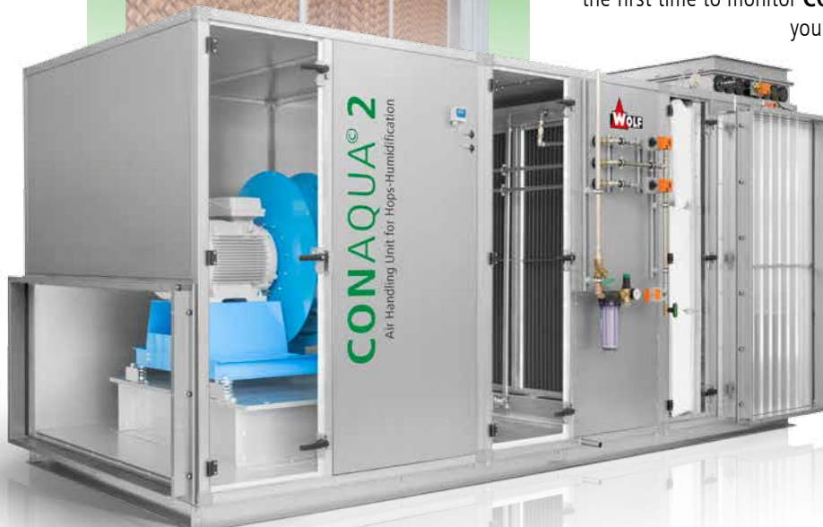
Humidifier CONAQUA ® 2

An integrated air filter is protecting the humidifier from contamination, increasing hop quality.